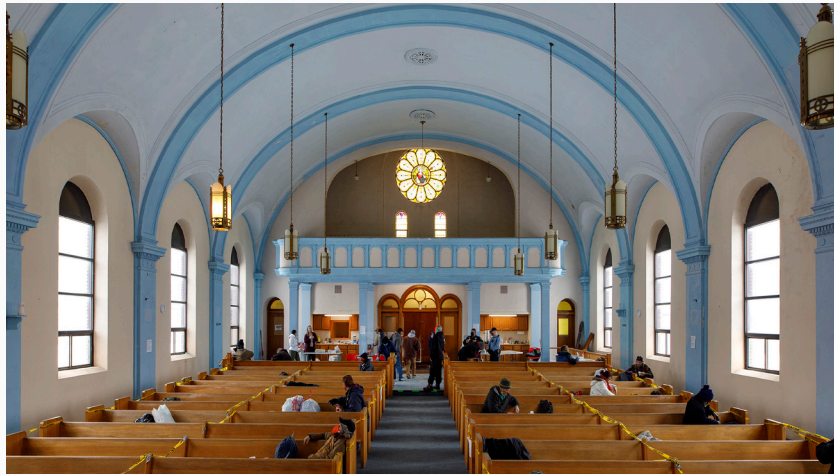
Individuals experiencing homelessness found a refuge from the bitter cold in the Warming Center that opened in January in the old sanctuary space of the Cross-Lines church building.

in Wyandotte County. From early January through the end of March, the space provided a safe, warm and welcoming