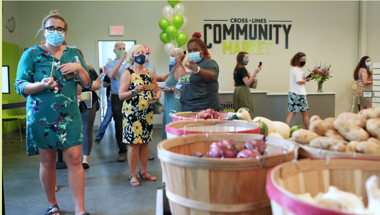
Guests enjoyed a tour of the Community Market during the Grand Opening event on August 30.

Aisles are neatly stocked with cereals, dried and canned goods, peanut butter and a variety of beans. Large glass-front refrigerators hold meat, milk,