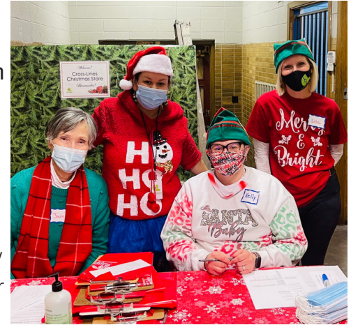
Christmas Store 2021