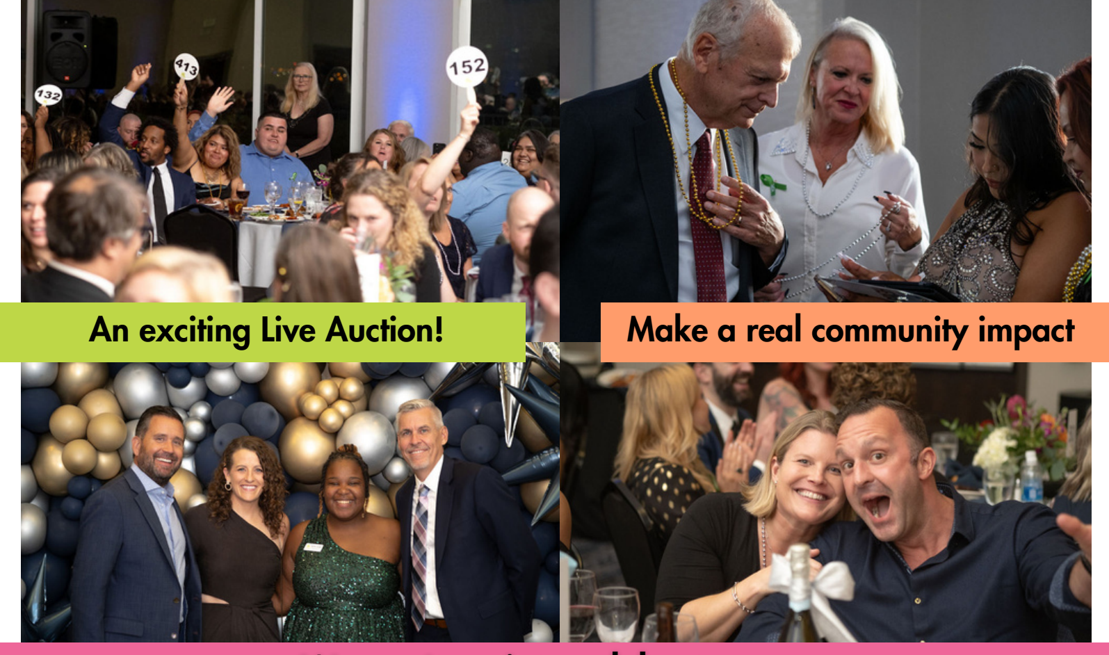
We can't wait to celebrate your support of Gala for Hope in 2024!